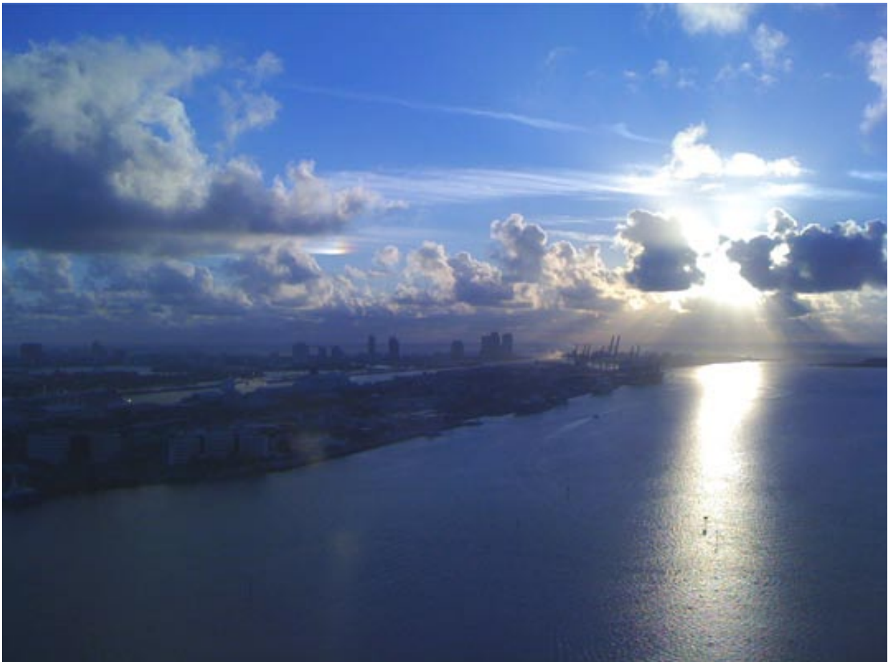
View from Breast Cancer Think Tank toward Biscayne Bay and South Beach 7:30 AM February 4, 2011

Click here for SABCS papers on HER2-positive breast cancer